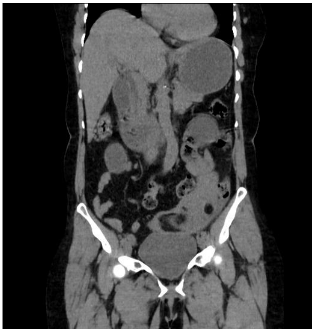
Fig 1: CT Scan revealed jejuno-ileal intussusception with acute small bowel obstruction.